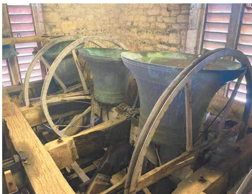
The tenor, fifth and fourth bells up at Frampton

I have found the 50 Things a brilliant way to reconnect to ringing, and many of them have helped me improve my skill as a ringer, and get me out to different towers to see how they have managed similar projects when major work is needed on listed bells and frames. The new friends I have made on ringing outings, completing quarter peals and ringing for special events like Christmas and New Year have given me a new network of contacts. Their experiences and knowledge have helped me with the project planning at Frampton, which I hope will eventually result in the bells ringing again.